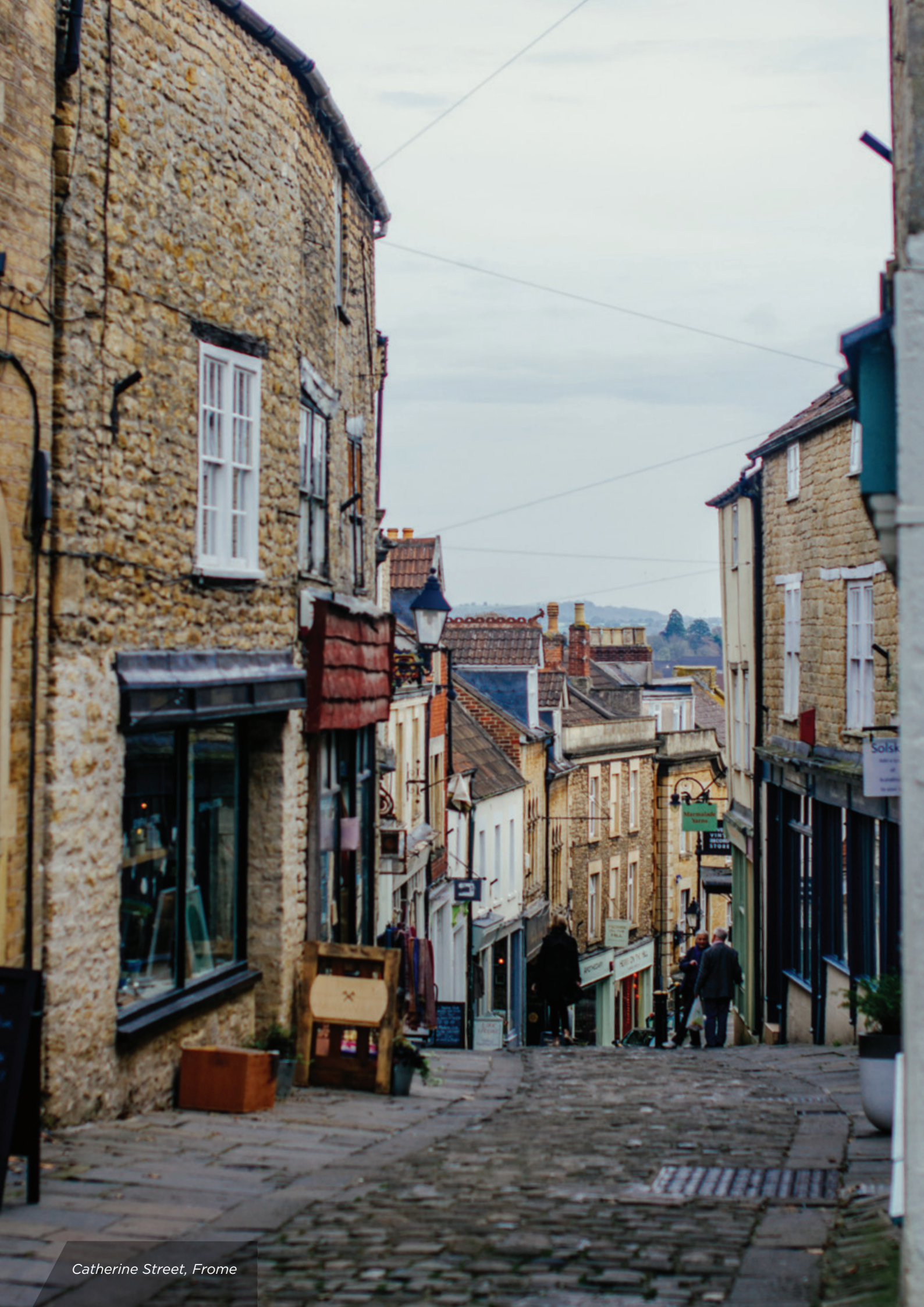
Catherine Street, Frome