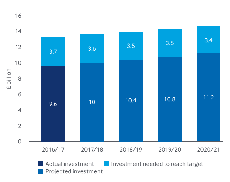
Figure 1: Investment in general practice excluding drug reimbursement (cash terms) 2016/17 – 2020/21.

Note: Projections for the total cost of drugs reimbursements is based on figures from 2011 – 2016