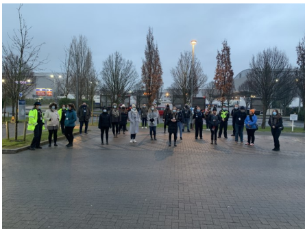
46 professionals join Somerset VRU for Day of Action in Bridgwater

District agency's raised concerns about young people effected by Anti Social Behaviour and substance misuse in Sedgemoor and a potential risk of exploitation from County Line drug dealing. The Violence Reduction Unit Data Group shared relevant information through a multi-agency triage of concerns, contextual safeguarding around at risk individuals and a professionals soft intelligence survey about the risk of County Lines. This information led to a support plan being put in place around the local PRU and support and disruption activity to reduce harm to those most at risk, including a Violence Reduction Unit led multi-agency day of action to target criminal exploitation.